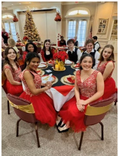
Talented guest performers from the Fort Worth School of Performing Arts.